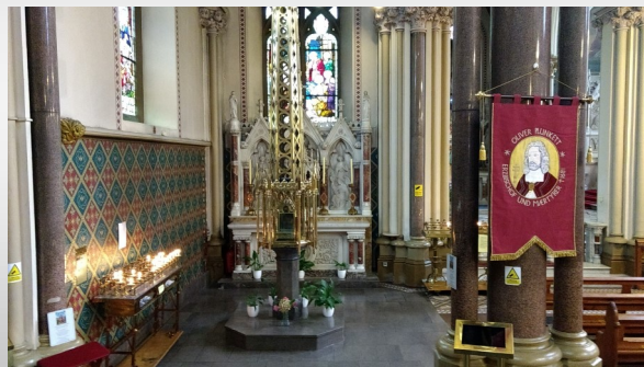
National Shrine in St Peter's Church, Drogheda. St Oliver Plunkett, Archbishop of Armagh