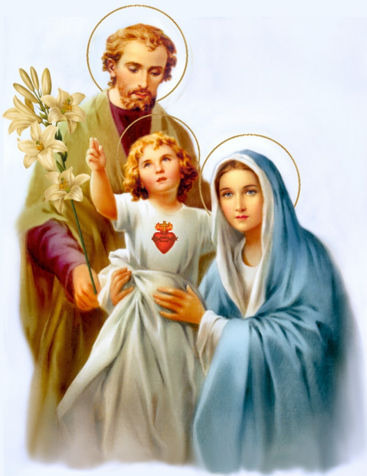
The Holy Family

During the Christmas Holiday Closure, we will not be able to update the bulletin with Mass Intentions and other new notices. We shall be able to update again for the 27 th of January 2019 bulletin.