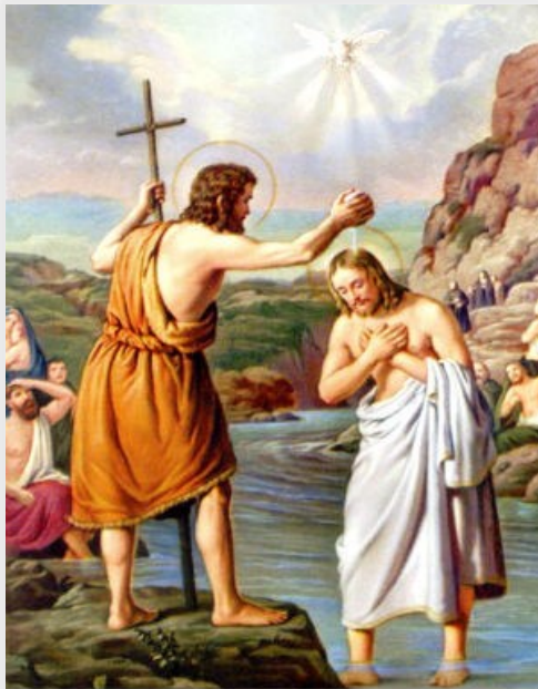
The Baptism of the Lord

Behold the One of whom John said: I have seen and testified that this is the Son of God. John 1:32, 34