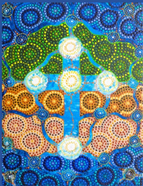
Artwork: Mamerby Dr. Leo Bacon

The harvest is plentiful, but the labourers are few Get up! Stand up! Show up!