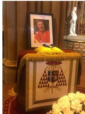
Cardinal George Pell lying in state at St Marys Cathedral