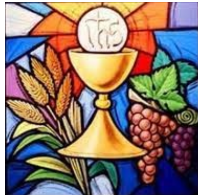
The Feast of the Most Holy Body and Blood of Christ (Corpus Christi)