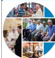
Bishop's Father's Day Appeal 3 September 2023

Our priests never stop giving their lives in service to our community. They dedicate themselves to carrying out God's ministry for as long as they are able. This Father's Day, let us show our thanks and appreciation for our priests' lifelong gifts of faithful service. Your compassionate donation will help our Clergy Support Foundation to care for our priests, and provide them with personalised health and wellbeing support. Please give generously to the Bishop's Father's Day Appeal at parracatholic.org/fathersdayappeal or scan this QR code. Thank you.