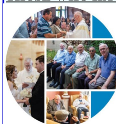
Bishop's Father's Day Appeal 3 September 2023

Our priests never stop giving their lives in service to our community. They dedicate themselves to carrying out God's ministry for as long as they are able. This Father's Day, let us show our thanks and appreciation for our priests' lifelong gifts of faithful service. Your compassionate donation will help our Clergy Support Foundation to care for our priests, and provide them with personalised health and wellbeing support. Please give generously