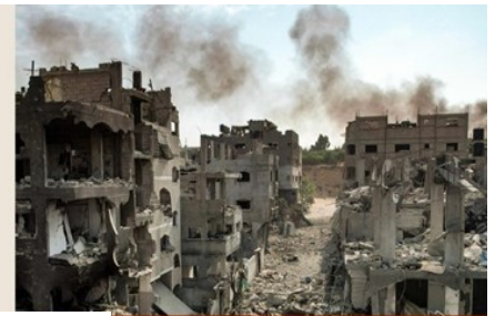
TABLE TALK WITH PEOPLE SEEKING ASYLUM

DONATE NOW www.caritas.org.au/gaza 1800 024 413