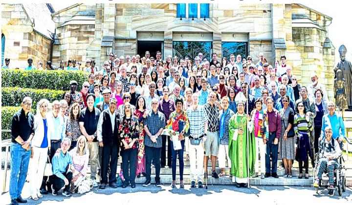
MARRIED COUPLES THANKED FOR FAITHFUL WITNESS TO GOD Married couples from Western Sydney and the Blue Mountains are seen following the annual Wedding Anniversary Mass at St Patrick's Cathedral, Parramatta, on Sunday 29 October 2023.

More details at: parracatholic.org/employment