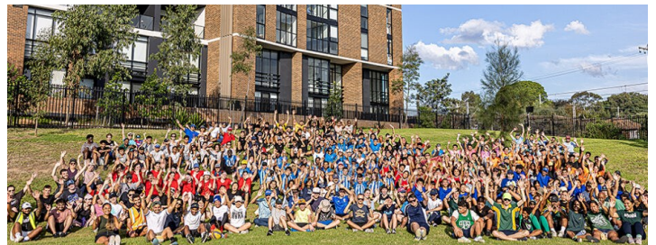
Participants at the 2024 LIFTED Sports Day, hosted by Catholic Youth Parramatta at Parramatta Marist High School, Westmead.

You are invited to an engaging conversation about caring for God's creation: Hear and discuss inspiring stories from lived experience and play a role in creating positive change in the spirit of Pope Francis' encyclical Laudato Si'. Join this Diocesan Table Talk on Monday 20 May, 6pm – 8:30pm, St Finbar's Parish Glenbrook. Light dinner will be provided on arrival. Please register by 12 May and find out more at tinyurl.com/laudatosi-table-talk