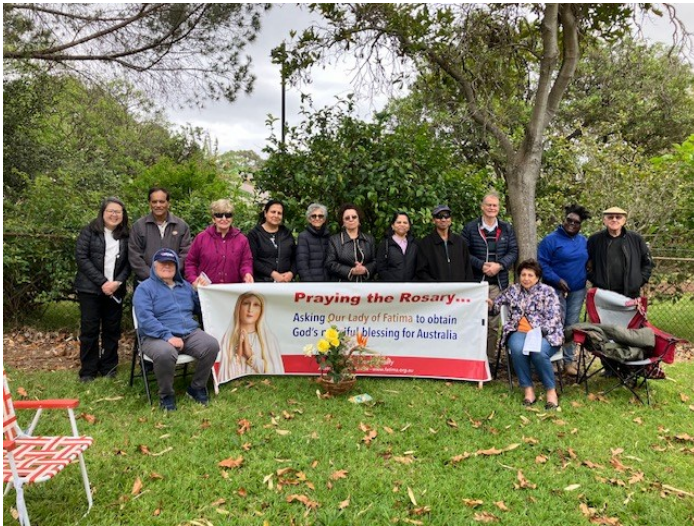
Rosary Group prayer for peace, last weekend.