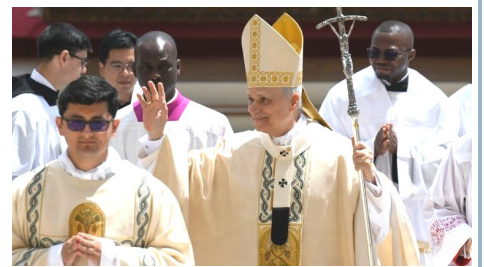
Pope Leo XIV greets the faithful at the Mass of Inauguration on

With thanks to Vatican News, where this article originally appeared.