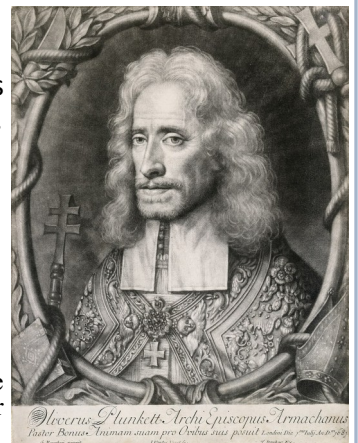
St. Oliver Plunkett, Canonized on 12 October 1975 in Rome by Pope St Paul VI (first new Irish saint for almost 700 years)